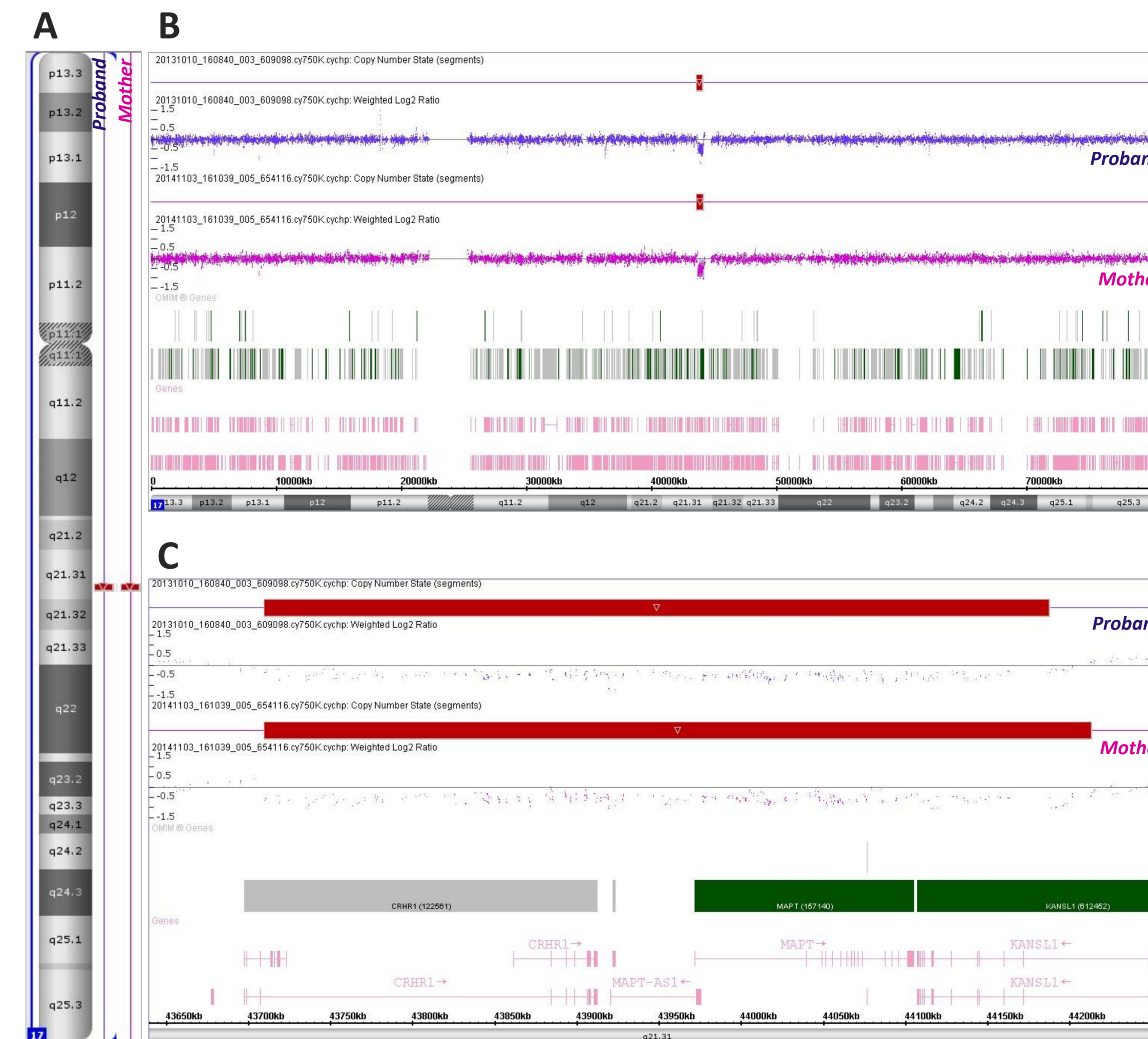
Figure 2. Array CGH results from proband and his mother. (A) view of chromosome 17 ideogram with focus on 17q21.31 microdeletion location; (B) view of oligonucleotides profiles over the entire chromosome 17 and (C) detailed view of the deletions, specifying affected genes.

The mother of the proband was studied at age 32, after the son diagnosis, by array CGH and a 503 Kb interstitial microdeletion at 17q21.31 (Chr17:43,710,150-44,213,434) was found and diagnosis was also concluded as KDVS. Results from array CGH are shown in Figure 2 and deleted genes are detailed in Table II.